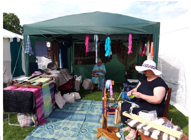
Guild tent at the Battle of Evesham