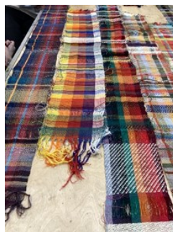
Design with texture Charlotte Grierson