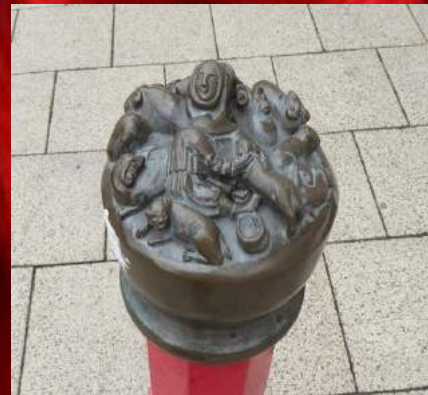
Finials from the Norwich Trail marker posts

https://www.youtube.com/watch?v=HgYDf634tc0